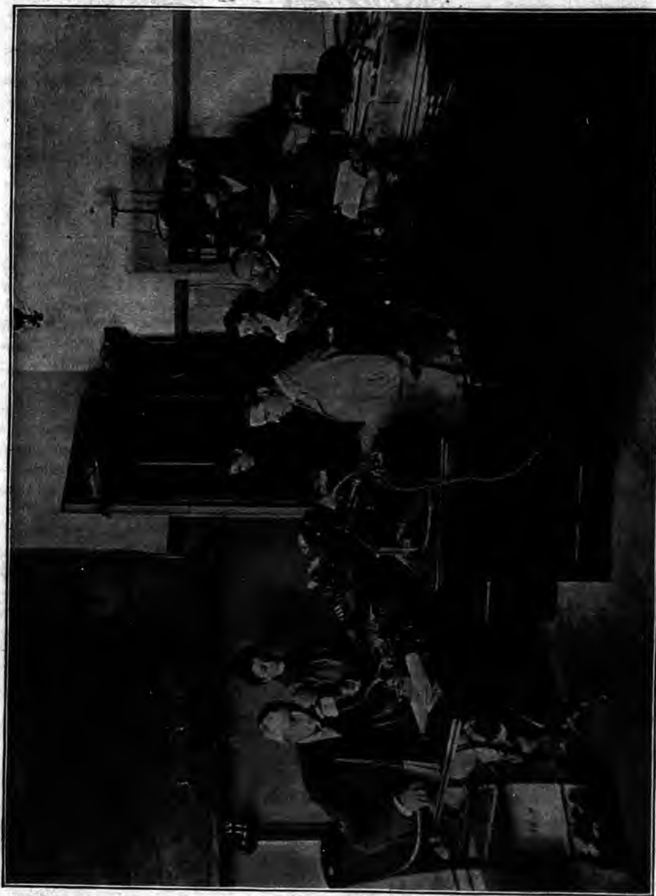
Senate Reporter's Room, House of Parliament, Canada.

THE SENATE REPORTER'S ROOM IN THE HOUSE OF PARLIAMENT, CANADA. THE ROOM IS A LARGE, DARKLY LIGHTED CHAMBER, WHERE REPORTERS ARE SEATED AT LONG TABLES, WAITING FOR THE SENATE TO SIT. THE PHOTOGRAPH CAPTURES THE BUSY, SILENT ATMO- SPHERE OF THE CHAMBER, WITH REPORTERS INTENSIVELY FOCUSED ON THEIR WORK. THE ARCHITECTURE OF THE ROOM IS CLASSICAL, WITH HIGH CEILINGS AND STURDY COLUMNS. THE LOW LIGHTING EMPHASIZES THE GEOMETRIC FORMS AND THE DENSE PACKING OF THE SEATING.